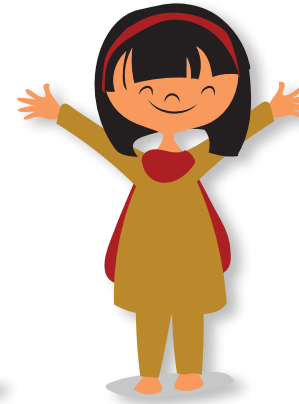
Saira (Samir's sister)